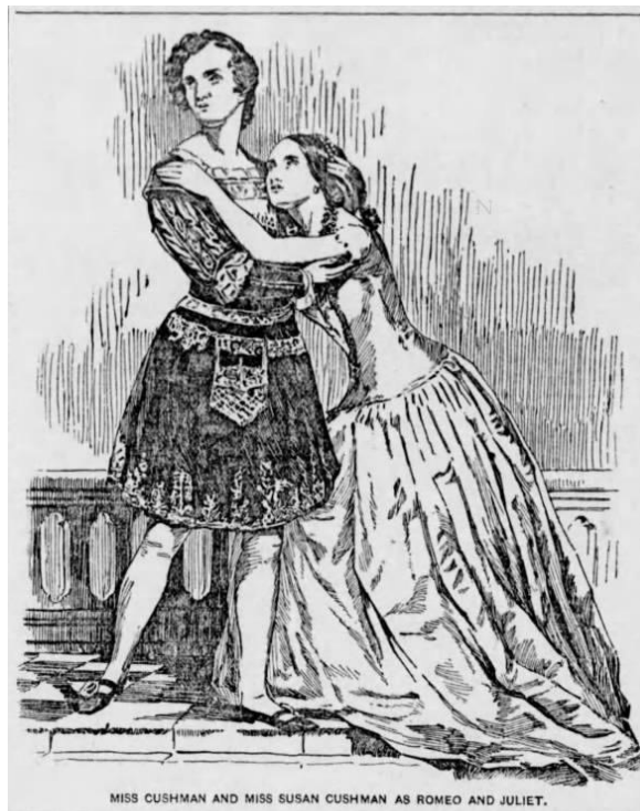
MISS CUSHMAN AND MISS SUSAN CUSHMAN AS ROMEO AND JULIET.

Romeo & Her Sister is presented by special arrangement with the playwright.